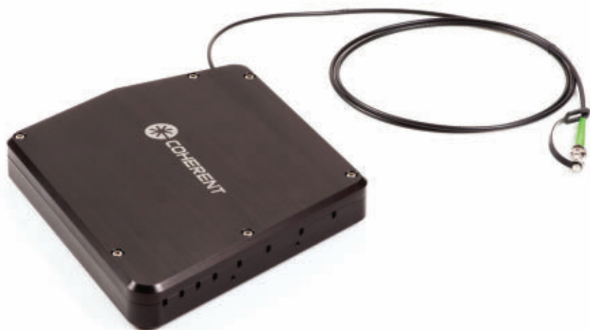
FIGURE 3. Instrument builders are generally looking for integrated laser and beam delivery solutions, and sometimes the ability to combine more than one wavelength. Coherent's Galaxy is an off-the-shelf solution that provides eight wavelength-dedicated plug-and-play input sockets to combine multiple lasers in a single output fiber.

sequences to assemble the entire sequence of the original uncut DNA.