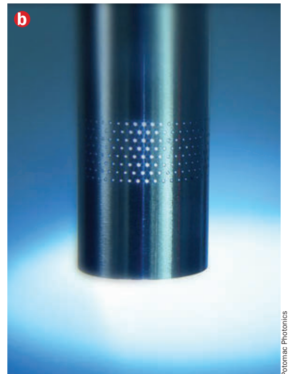
Lasers help manufacturers micromachine plastics (a) and metals (b) by drilling micron-size holes.