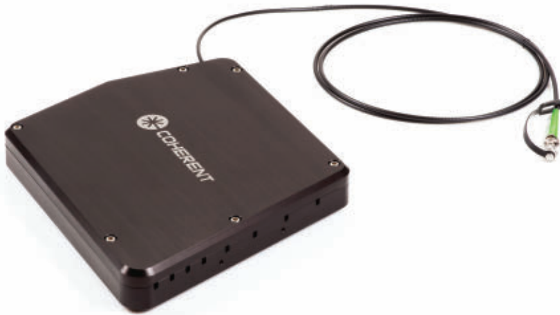
Figure 4. The OBIS Galaxy optical bus uses eight wavelength-dedicated plug-and-play input sockets to combine multiple lasers in a single output fiber.

3-D structure to roughly simulate the shape of a real esophagus.