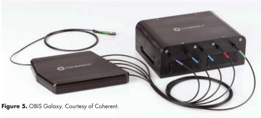
Figure 5. OBIS Galaxy.