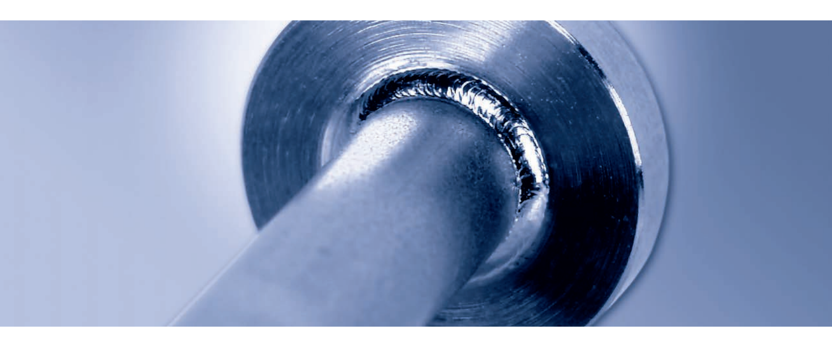
The Benchmark Manual Welding Laser